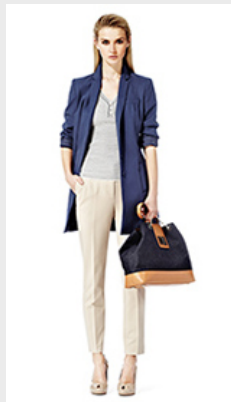
Reiss Bright Blue Straight line 97% cotton, 3% elastane coat at £225.00

As my clients will tell you, I believe in the magic third piece. This is the item that pulls your whole look together. There's a big trend this year, which offers the perfect third piece: the colourful spring coat. This one garment can lift your entire wardrobe, particularly if you follow my clear and simple styling tips. Look for a straight line or a slightly oversized duster style. The length should be between hip and knee. If you are fairly small, you will find the hip length most flattering because it will make you look taller. Play with the colour. Choose a coat that will go well over both black and white. Keep the silhouette underneath clean skinny or straight trousers (but not a boot leg or flares) or opaque tights, a straight or pencil skirt or a sheath dress. Look out for these which I think are great investments: