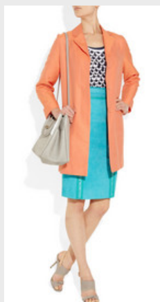
Johathan Saunders Cotton and Silk Blend at £1,040