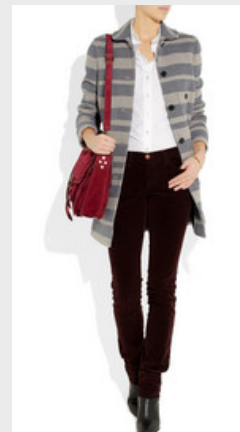
J Crew Stadium stripe wool at $400.00